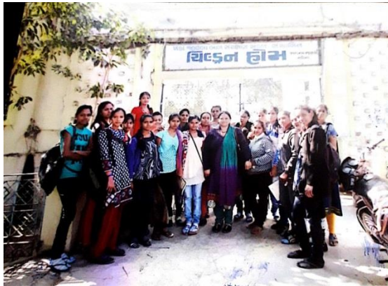
Children Observation Home