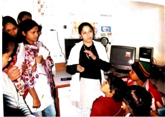
Deaf and Dum School