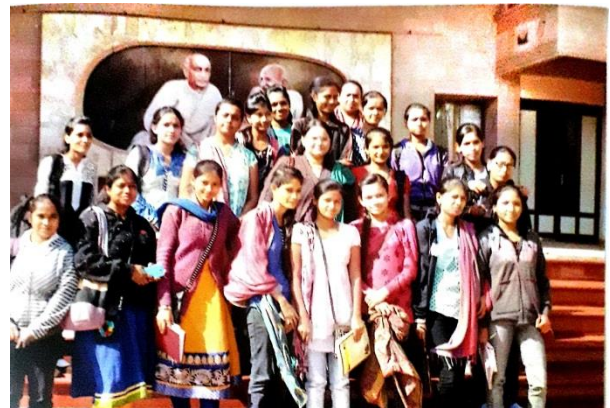
Hindu Anath Ashram