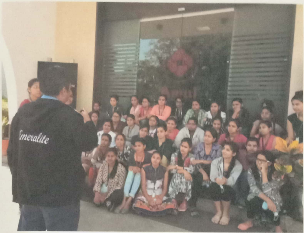
17. Department of foods and nutrition organized A parents teacher meeting for T.Y.B.Sc F.N. and FSQC students by involving all faculties on 05/03/2016.